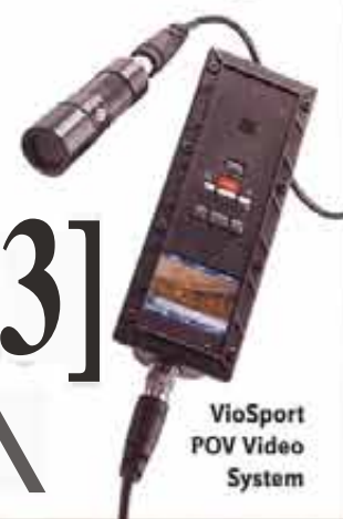
VioSport POV Video System