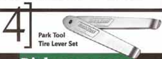
Park Tool Tire Lever Set

4) Park Tool Tire Lever Set Ideal for changing downhill and freestyle tires, this heavy duty set is designed for the toughest tire and rim combos. Made of steel, the tools are 20 cm long for superior leverage. $24; parktool.com