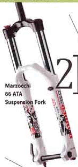
Marzocchi 66 ATA Suspension Fork

Can't live without: Trek's full-suspension mountain bike "For a big-mountain race, you need eight inches of travel [how much your frame moves in relation to your tires], full suspension and hydraulic brakes." - Shereen Dindar